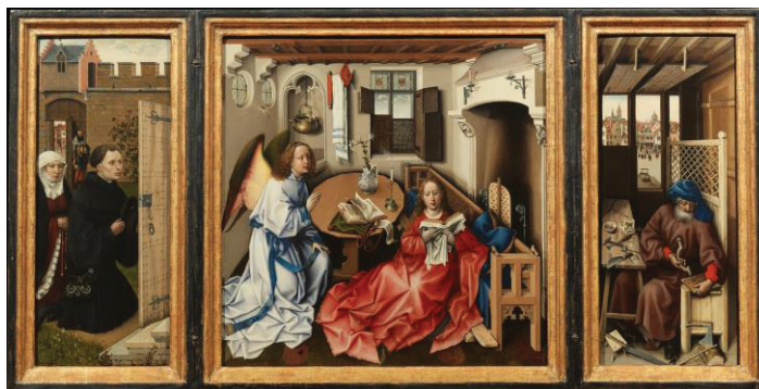
Workshop of Robert Campin (Master of Flemalle), Merode Altarpiece Netherlandish, 1427-1432 New York, Metropolitan Museum of Art, The Cloisters Collection

One of the most interesting images of Saint Joseph from the later middle ages/early Renaissance period appears on the right wing of the Annunciation triptych known as the Merode Altarpiece.